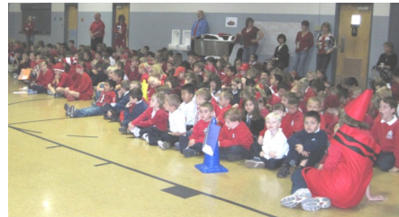
St. Mark's School Celebrates "Red Ribbon Week"