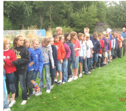
5th Graders on Field Trip