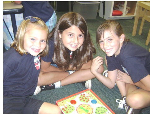
Kindergarten with 5th Grade Buddies